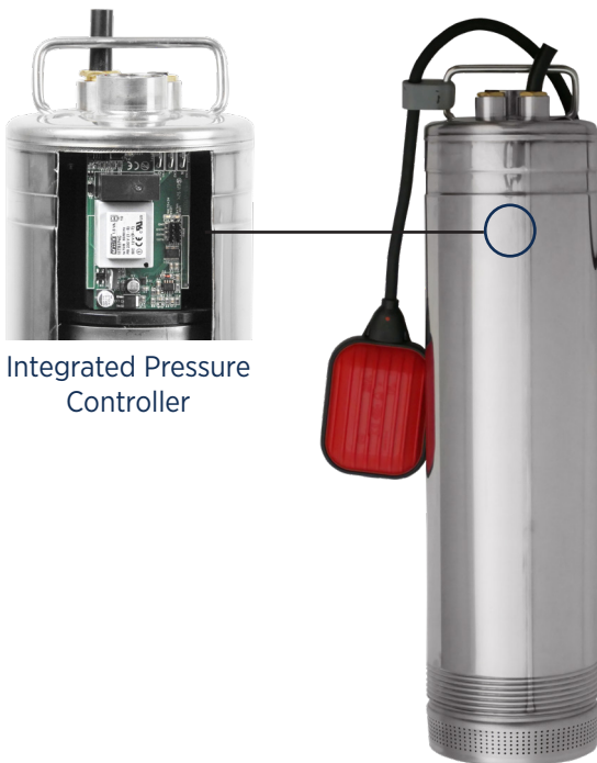
Integrated Pressure Controller